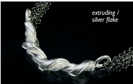
extruding / silver flake

Explore real silver in clay form! This moldable, rollable clay is amazing! Learn about the different varieties of clay and see examples of many different applications. You will make three personalized pieces while learning about tools, and techniques. You'll learn everything from rolling and texturing the clay, to sanding, polishing and oxidizing. You'll leave with finished jewelry and possess the skills which are the foundation of your future creative explorations with ACS! All skill levels welcome. Materials fee.