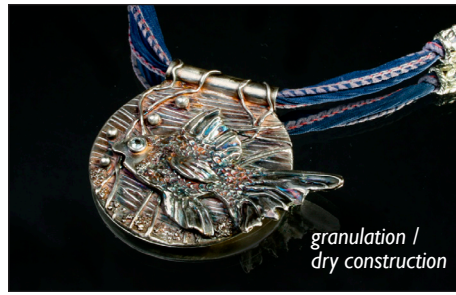
granulation / dry construction

This focal rock, really! Three separate overlapping panels are free to swing back and forth because they are held together with hidden jump rings. This articulated design makes the piece fun to wear and will show you a new decorative way to attach bail backs and screw eyes. Pre-requisite: Intro to ACS. Materials list.