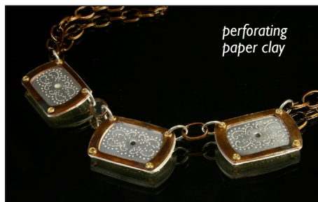
perforating paper clay

Travel back to the childhood land of fantasy and delight of the Dr. Seuss classic The Lorax which inspired this whimsical ring. You will learn how to size and make a perfect flat band and also how to use syringe to extrude the dancing topiaries. This will give you lots of stress-free syringe practice too! Pre-requisite: Intro to ACS. Materials list.