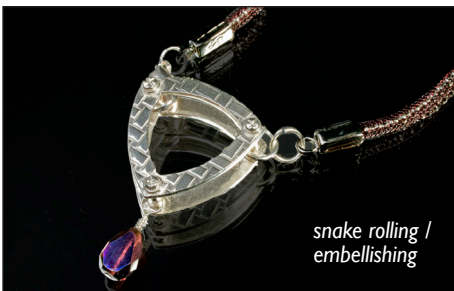
snake rolling / embellishing

Make a texture sheet personalized with your name or logo! I will be setting up the logos with many on one sheet for you. Next you will learn how to make a photopolymer texture plate so you can quickly and easily make batches of hang tags for your finished jewelry creations OR make tiny signature chops to attach to your metal clay creations as greenware. Let everyone know what YOU made! Class fee includes 30 min. of artwork generation per student. Additional design time may be purchased. Pre-requisite: Intro to ACS. Materials list.