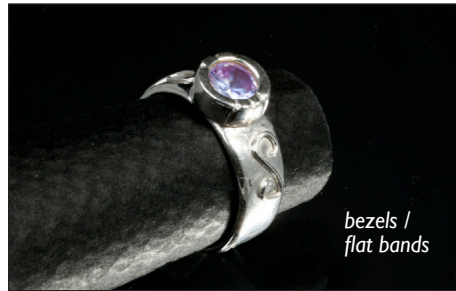
bezels / flat bands

If you have a hard time deciding which earrings to wear, you will want to make these! Create frames to house custom double-sided spinning coins which will give your earrings playful movement. You can create additional inserts later for more variety. Once you learn this skill, you will certainly want to create additional whimsical earrings with a variety of textures to make different statements. Pre-requisite: Intro to ACS. Materials list.