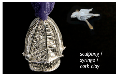
sculpting / syringe / cork clay

You just might have to resist the urge to salute and recite, "live long and prosper" when you see this pendant. Learn how to create realistic scales, roll perfectly sized snakes and assemble this dimensional pendant. Maybe when you are staring into the depths, you might be taken on a warp speed trip through the universe...don't blink, you might miss it! Pre-requisite: Intro to ACS. Materials list.