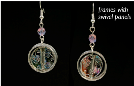
frames with swivel panels

Stop by, spend about an hour and make up to 4 pieces of pure silver jewelry, no experience necessary. Try out the easy Lilly Ollo way of molding and stamping metal clay. There are hundreds of designs to mix-and-match to design your own pieces. All tools and supplies are included. Grab a friend and come by for some fun and creativity! All skill levels welcome.