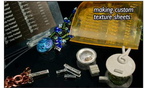
making custom texture sheets

Discover how to take ring making to a new level by creating your own stone setting. You will learn how to roll your clay to the proper thickness according to the size of your stone and how to set that stone to the proper depth. We'll throw in a little carving to personalize your setting and then attach it to the band. Pre-requisite: Intro to ACS plus 6 hours of ACS work. Materials list.