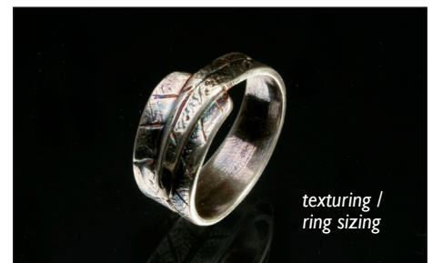
texturing / ring sizing

Try a new technique with paper clay, perforating! The traditional paper craft translates beautifully into the much more durable silver rendition. The result resembles the classic decorative tin ceilings of yesteryear. The reverse side has a lovely embossed design, wear it either way! You will also learn how to do some cold connection skills to put it all together. Pre-requisite: Intro to ACS. Materials list.