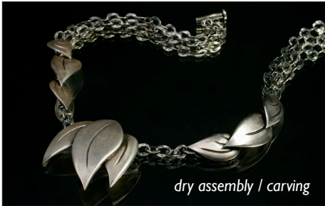
dry assembly / carving

645-B So. State College Blvd., Fullerton, California 92831 714-446-9000 To register, call 714-381-5936 For more information, visit www.cpCreativePlace.com or email info@cindypankopf.com