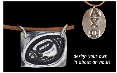
design your own in about an hour!

Learn how to make this cute little guy hanging out in his fishbowl while merrily blowing bubbles. You will create a fun environment and give him some plants to swim amongst. He'll get some fishy scales, a colorful fish eye and flamboyant fins. Add some bubbles and dressy silver flakes for sand and you'll have a friend for life. Pre-requisite: Intro to ACS. Materials list.