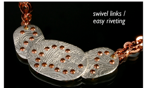
swivel links / easy riveting

Rivet Decor Links $75 by Cindy Pankopf 2 parts: Wed. March 13 & 20 (6-9p)